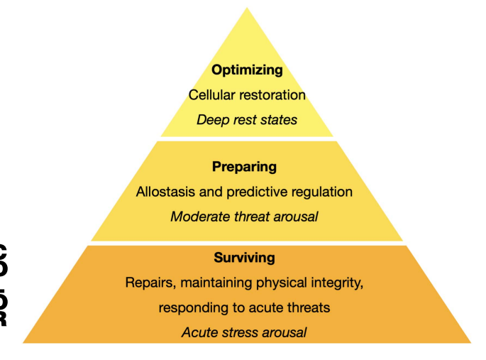
Figure 3 Hierarchy of Biological Functions Based on Contextual Demands and States of Arousal

Note. This figure represents a hierarchy of biological needs that depends on energy resources deployed among cells and across the body. At the bottom of the hierarchy are basic needs for surviving in the present moment, such as repairing acute damage (e.g., proteins) and maintaining physical integrity (e.g., membrane potential), as well as responding to acute threats. Once those needs are met, then the organism can devote energy toward the next level of need—preparing for coming environmental demands; this process is also termed predictive regulation or allostasis (Bobba-Alves, Juster, & Picard, 2022). If this level does not consume all energy resources, then energy can finally be used toward optimizing. In other words, once cellular and physiological systems are working well, and there are no threats to take care of or plan for, then energy is directed toward cellular restoration. Each level of the hierarchy is associated with a different allostatic state, as indicated in the figure with italicized text. See the online article for the color version of this figure.